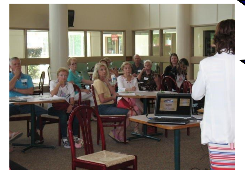
On May 12, 2015 an orientation was held for those who were interested in becoming poll workers for the 2016 election cycle.